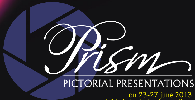
PHOTO EXHIBITION 2013